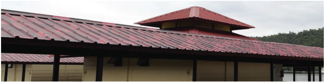
HSRM Hideck® Roofing