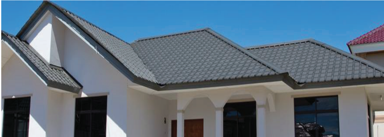
HSRM Steptile ® Roofing